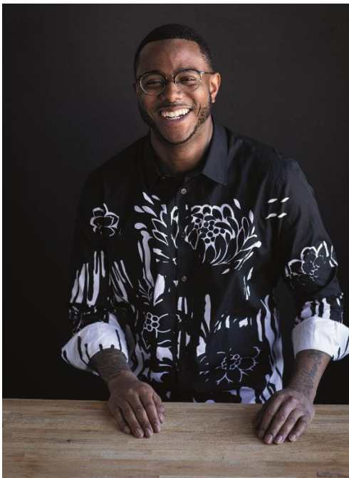
Kwame Onwuachi